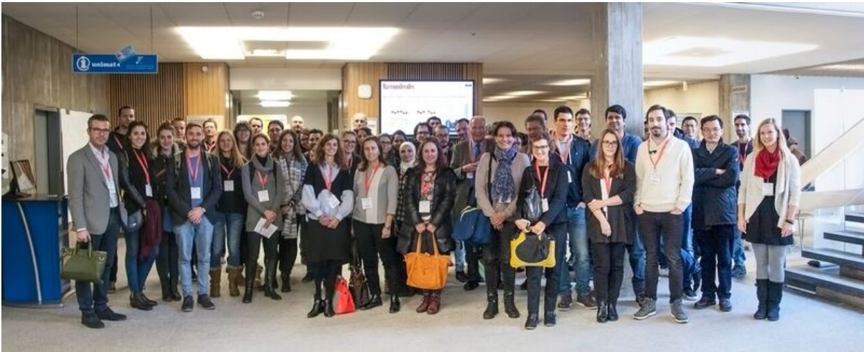
Meeting in 2017