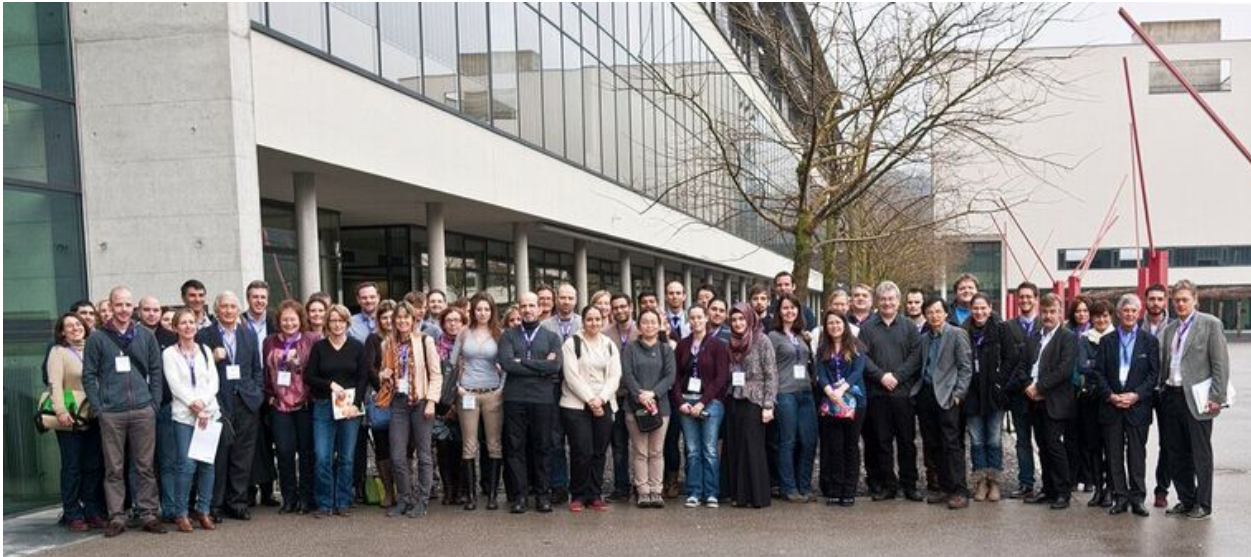
Meeting in 2016